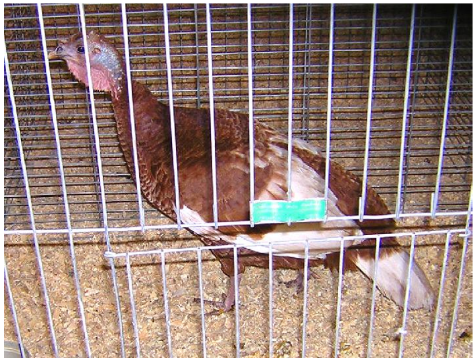
The Grand Champion Turkey was a Bourbon Red Hen by Ann Charles (SkyBlueEgg). The Heritage Poultry Conservancy awarded $100 to the Grand Champion Turkey in Show.

Reserve Grand Champion Bird of the show (and Reserve Champion Bantam) was a SC Rhode Island Red Bantam cock by Chyna Shaw