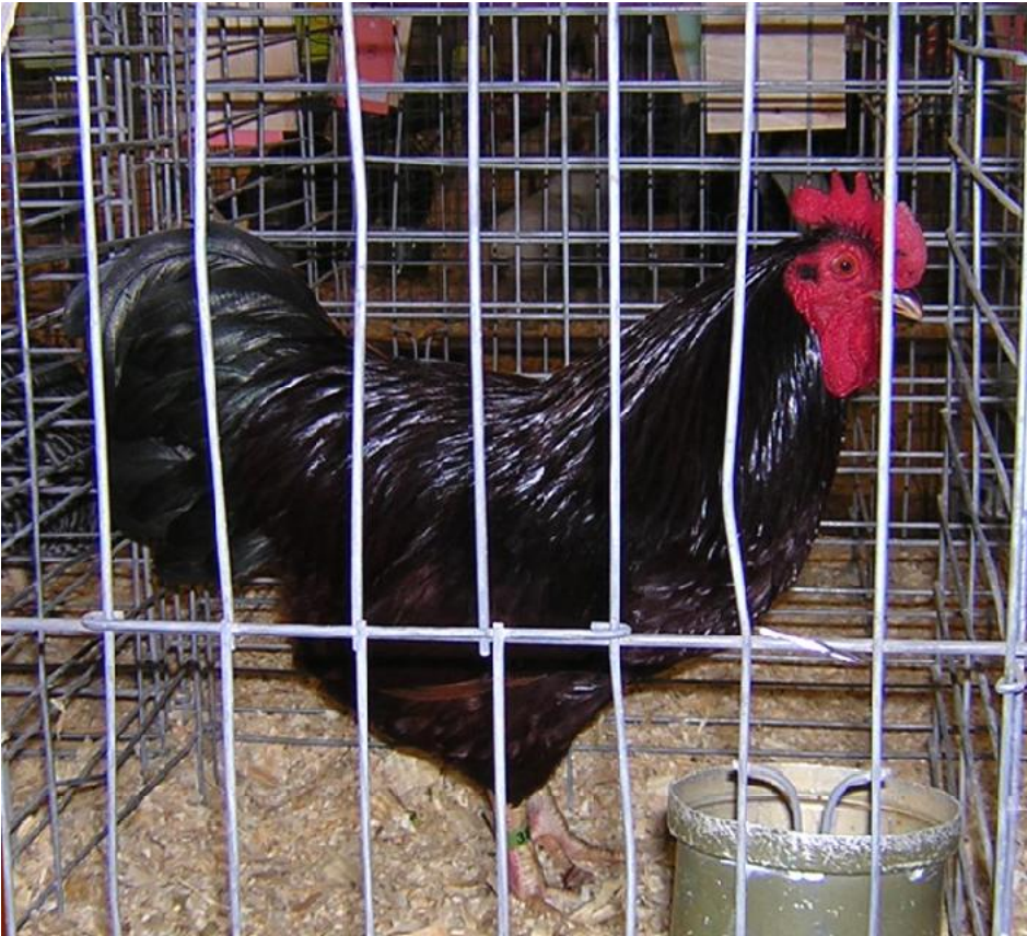
Reserve Grand Champion Bird of the show (and Reserve Champion Bantam) was a SC Rhode Island Red Bantam cock by Chyna Shaw. The Heritage Poultry Conservancy awarded $150

up. One good thing about fair shows is that the premium money usually does help to defray expenses a bit down the line.